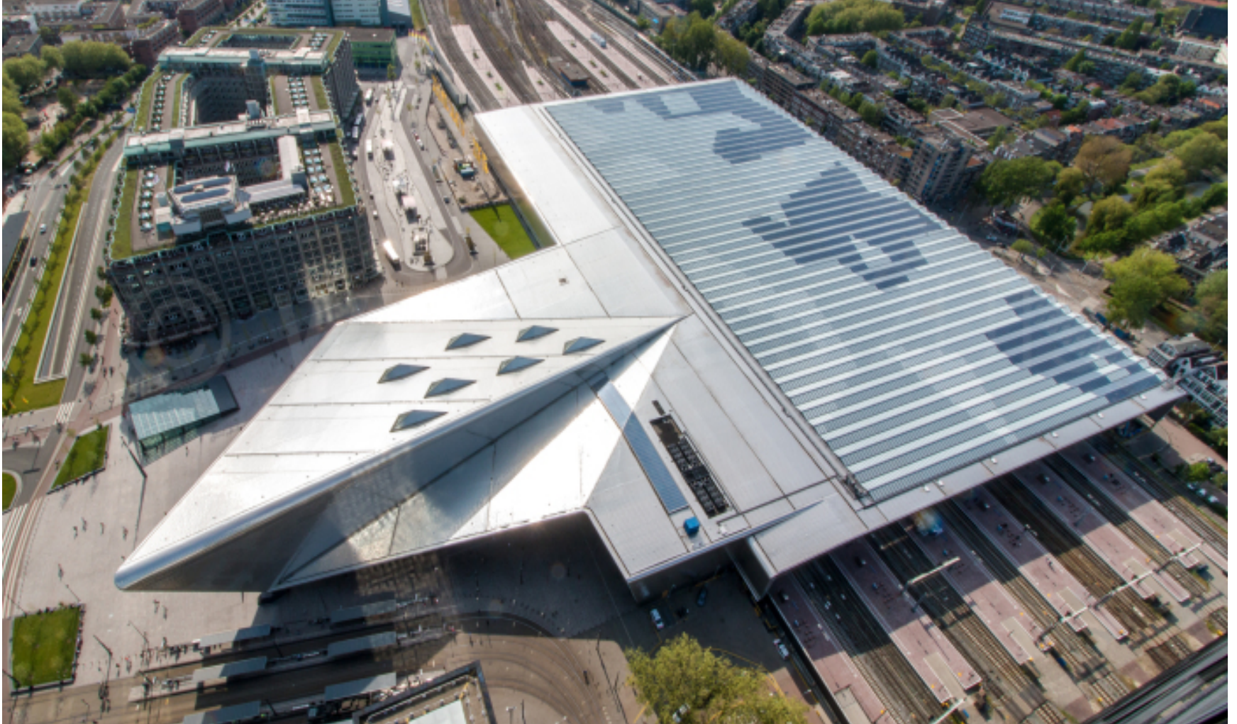
Rotterdam Central Train Station, Netherlands