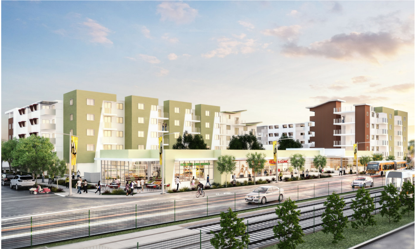
Rolland Curtis Gardens, Los Angeles