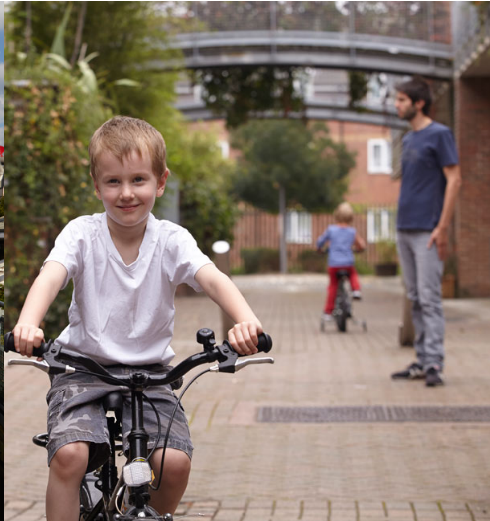
BedZed, London, England