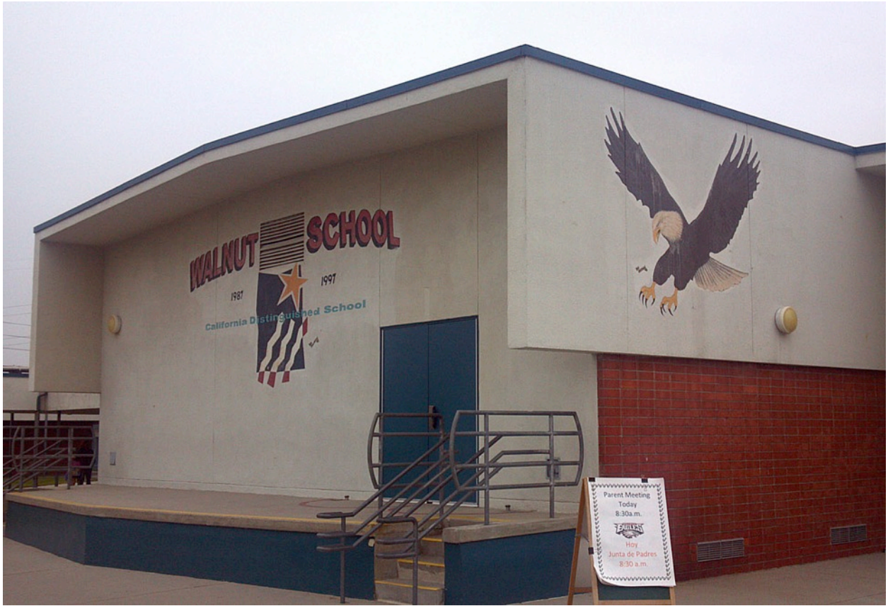
Walnut Elementary School