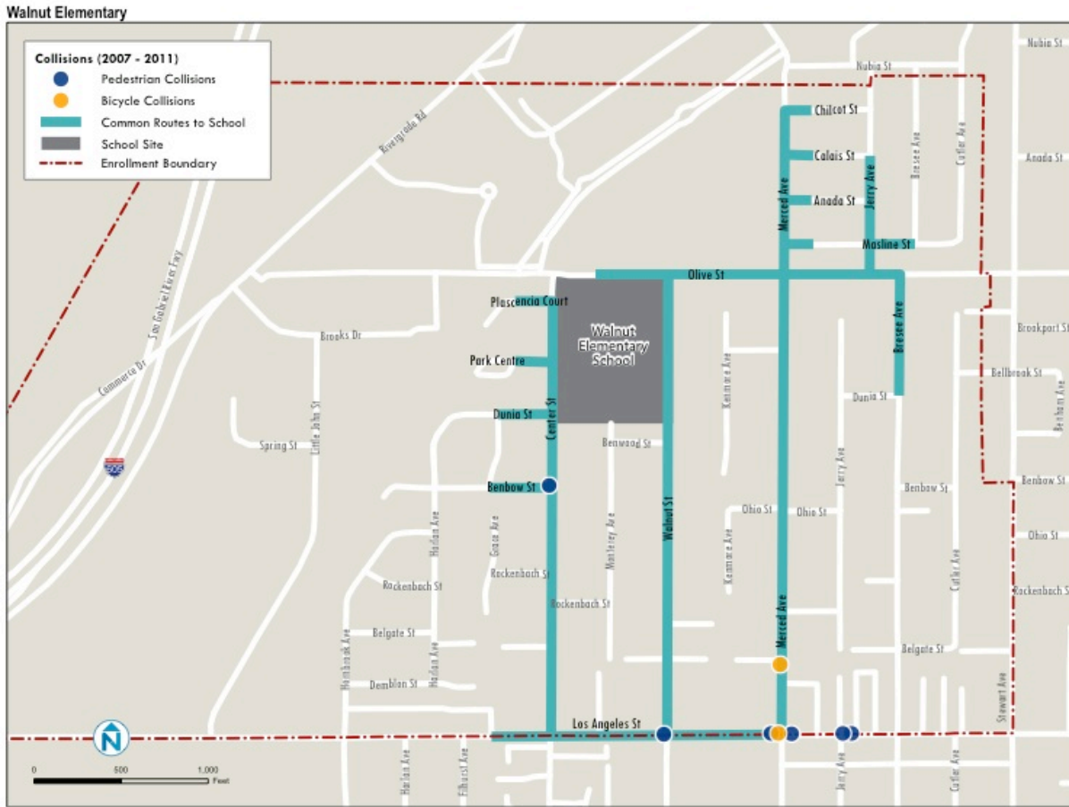
California Transportation Injury Mapping System data (2007-2011)

The following map displays bicyclist and pedestrian involved crashes for a five-year period between 2007 and 2011.