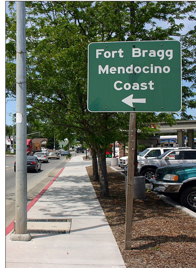
Figure 4-8 A sign in Willits, CA indicates a route to the coast.