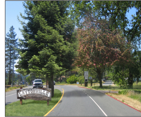
Figure 4-5 provides an illustrative photo simulation of a potential gateway treatment for the Southern Gateway into Laytonville's Town Center.