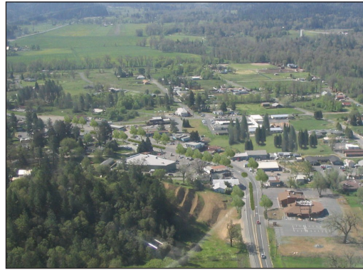
Figure 4-4 provides an illustrative photo simulation of a potential gateway treatment for the Northern Gateway into Laytonville's Town Center.