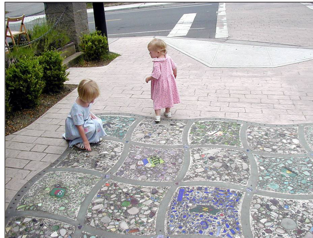
Figure 4-10 Sidewalk art in Encinitas, CA.