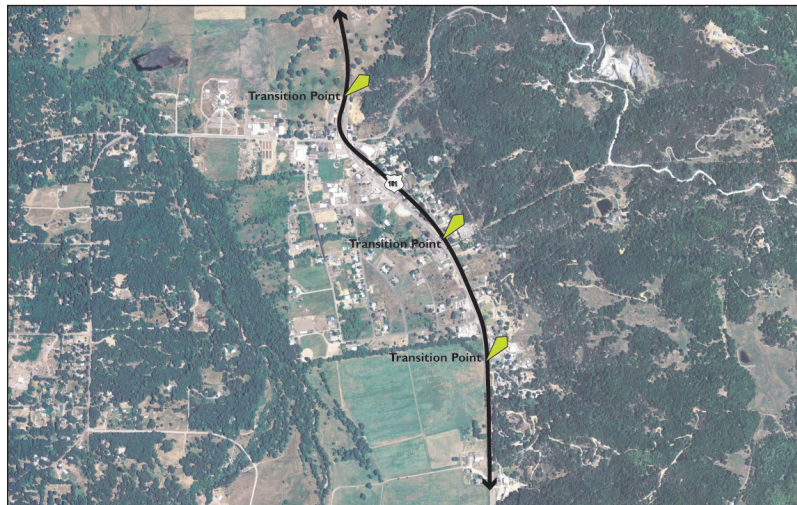
Figure 4-2 identifies the locations of Laytonville's key transition points.

Transition points represent appropriate locations for gateway features, enhanced signage, and changes in the posted speed limit. Additionally, the identified transition points demarcate a change in uses, density and design along Highway 101, signaling the transition into and out of the Town Center.