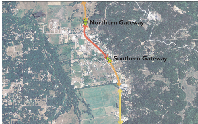
Figure 4-3 indicates the locations of the proposed gateway features.