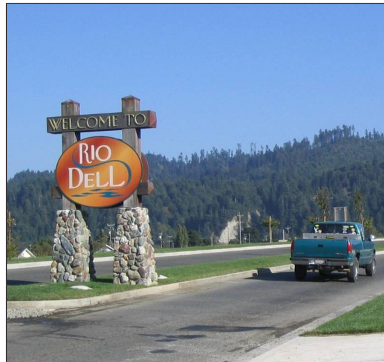
Figure 4-6 Gateway in Rio Dell, Humboldt County.