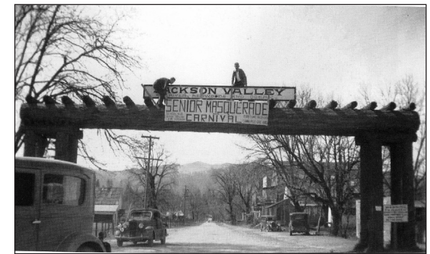
Figure 4-7 Historic Gateway at Branscomb Road and 101.