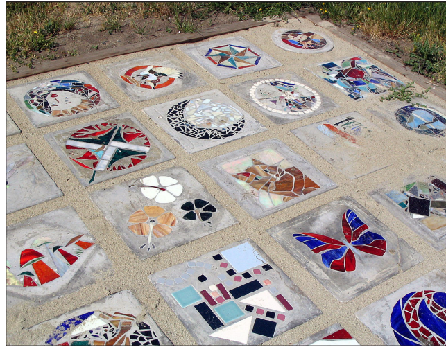
Figure 4-9 Tiles made by High School students could be incorporated into sidewalks.

For additional recommendations regarding the use and placement of landscaping within the Town Center, refer to Chapter 7, Design Guidelines, of this report.