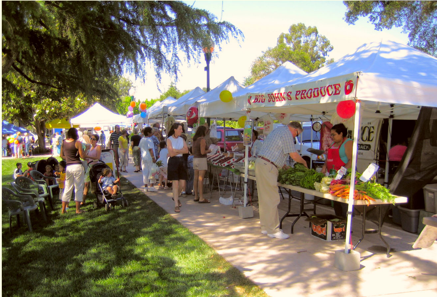
Atascadero Farmer's Market