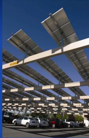
250 KW Solar Tracking Carport